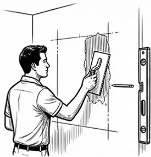
1. Prepare Wall and Apply Adhesive

CAEME-CFT3D Feather 3D Cement Brick using high-quality tile glue and structural adhesive. First, mark and measure the installation area carefully to reduce cutting, as the panels are special-shaped. Ensure the wall surface is clean, dry, and level. Apply adhesive evenly and fix panels firmly according to the manufacturer's installation guidelines for best results.