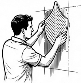
2. Set First Panel