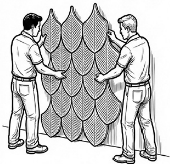
3. Install & Align Panels