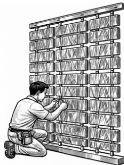
4. Complete Grid & Final Tightening