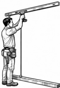
1. Secure Top & Bottom Aluminum Channels

ORNVITRUM – YZ0PDGT Prismatic Decorative Glass Tile install top and bottom aluminium channels securely to the ceiling and floor using anchor bolts and ensure perfect level alignment. Insert vertical stainless steel rods between the channels and fix support connectors with light tightening. Mount the first row of prismatic glass panels horizontally onto the lower supports using clips between panels. Continue stacking rows upward and fully tighten all connectors to complete the installation securely.