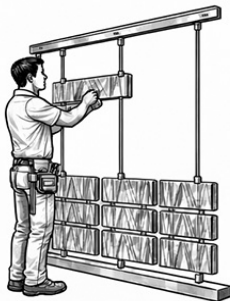
3. Mount First Row of Horizontal Prismatic Glass Panels